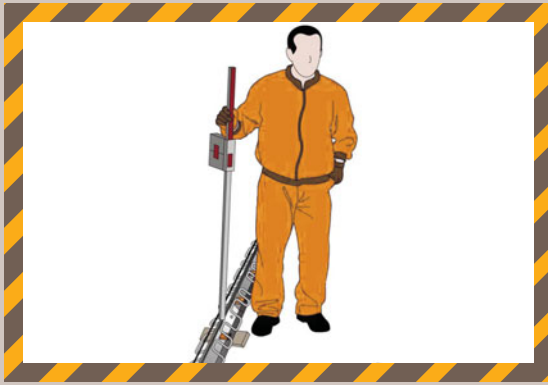
Set to level.