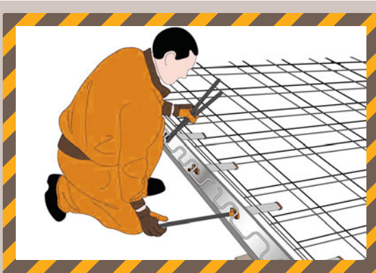
Placing of the steel mesh and dowel bars.