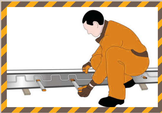
Joint material application and installation of the plastic sleeves.